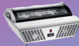
SCOOPER 80CM X 70 CM 6 BOXES OF 2.3 L