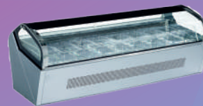
SCOOPER PRO 120CM X 90 CM 16 BOXES OF 2.3 LITER